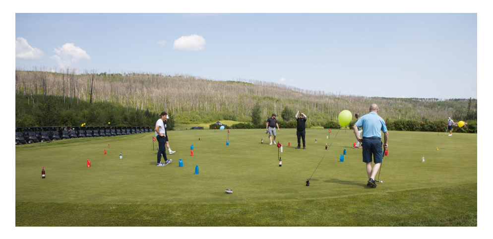
Photography by <u>Payden MacDougall</u> (see the rest of the photos <u>here</u>)